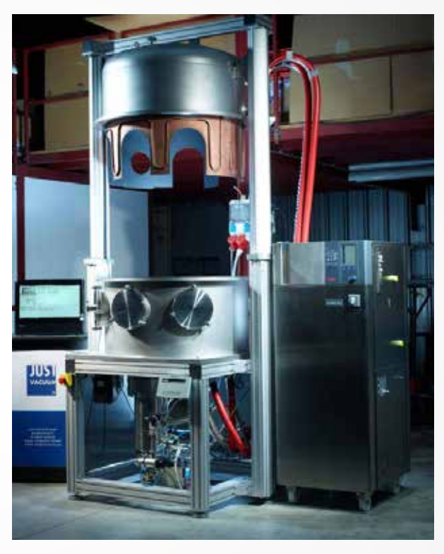
High vacuum system TVAC 2.0 with Unistat 912w

The high-vacuum system TVAC 2.0 for this use works in a temperature range from -75°C to +45°C (200 K to 320 K). With software specially developed for this system by JUST VACUUM, temperature profiles can be reproduced and displayed as a table or graph. This software controls all other functions of the system.